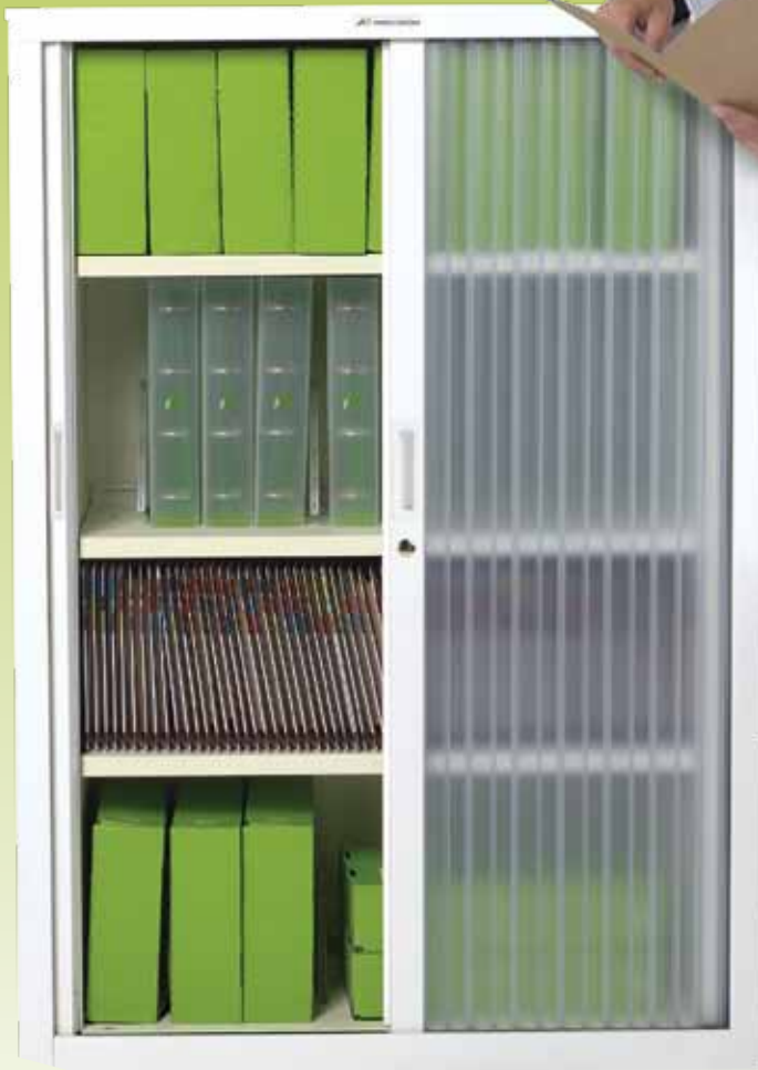
Smartstore G3 4 level 900mm wide

Precision will take your organisation to new heights because organisation is simply about efficiency. Smartstore is so efficient we almost called it the 'personal assistant', but then we didn't want to upset anyone.