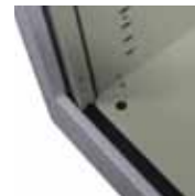
levelling foot access