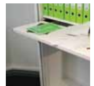
pull-out reference shelf