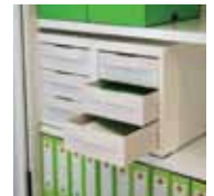
utility drawer unit