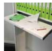
glide out work-shelf