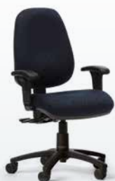
OTTO + ARMS