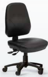
OTTO BLACK PU