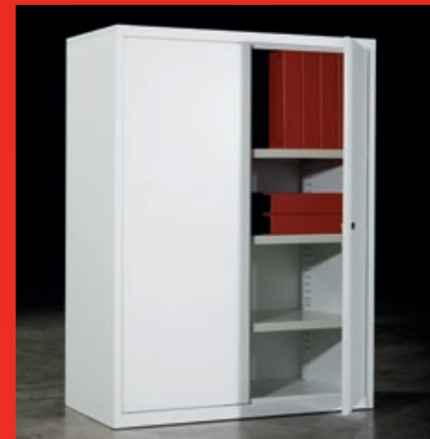
With doors, swing door cabinet.