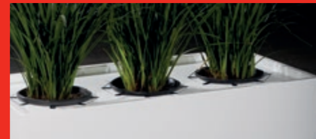
Plain planter, designed to achieve maximum strength and rigidity.