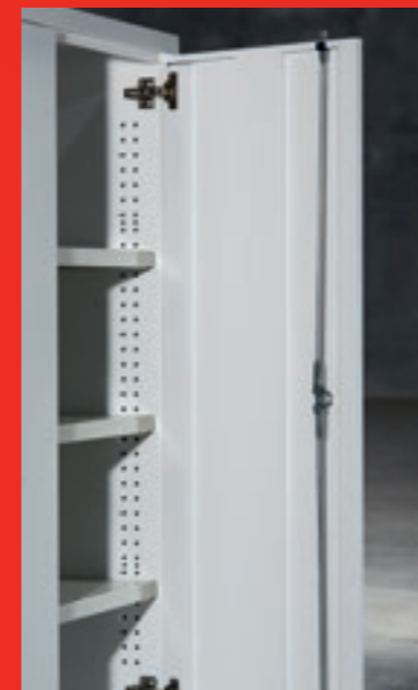
Lockable doors provide extra security for sensitive documents.