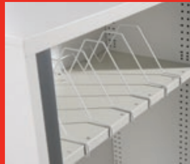
Wrap around wire rack.