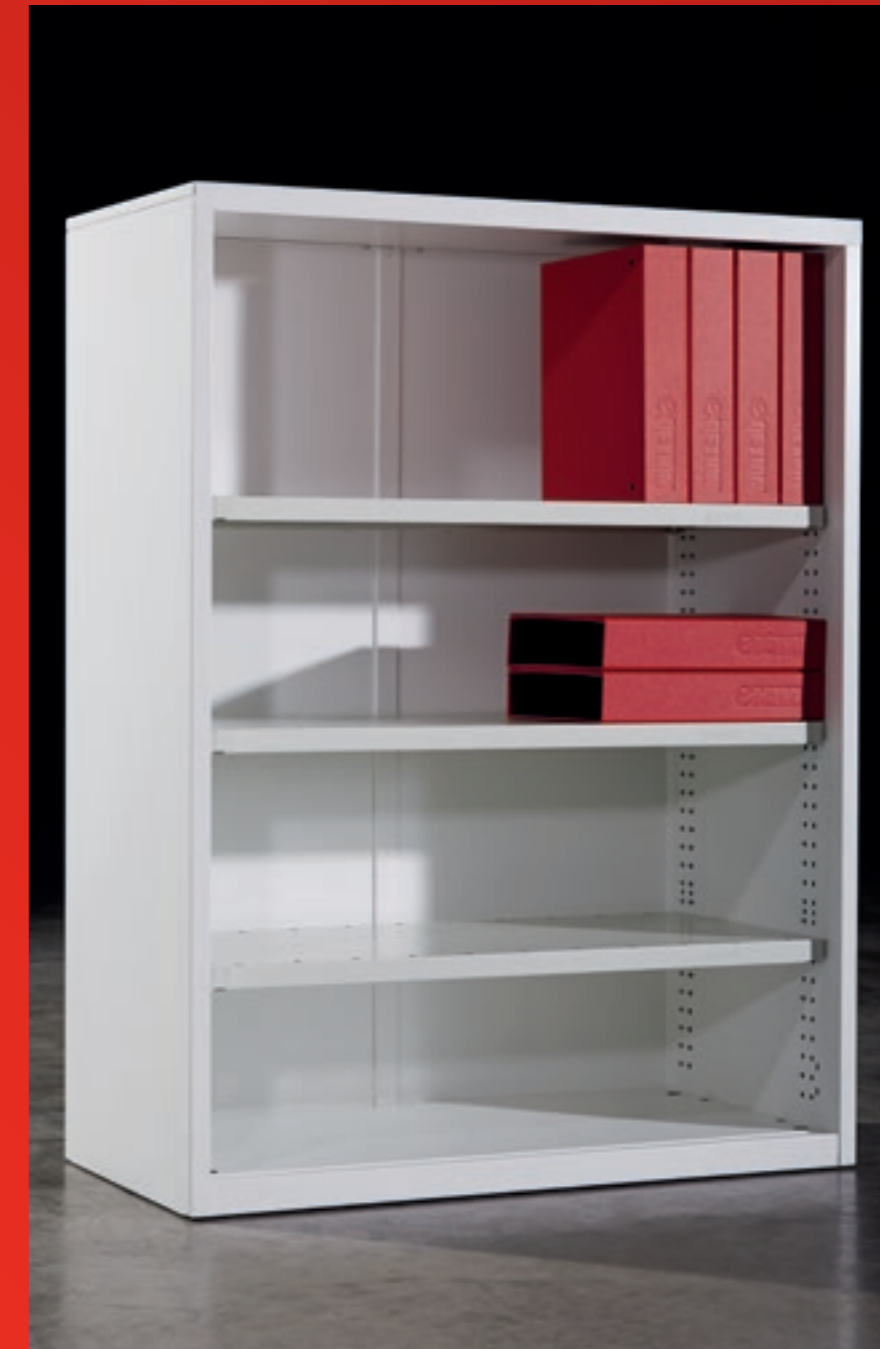
Without doors, bookcase.