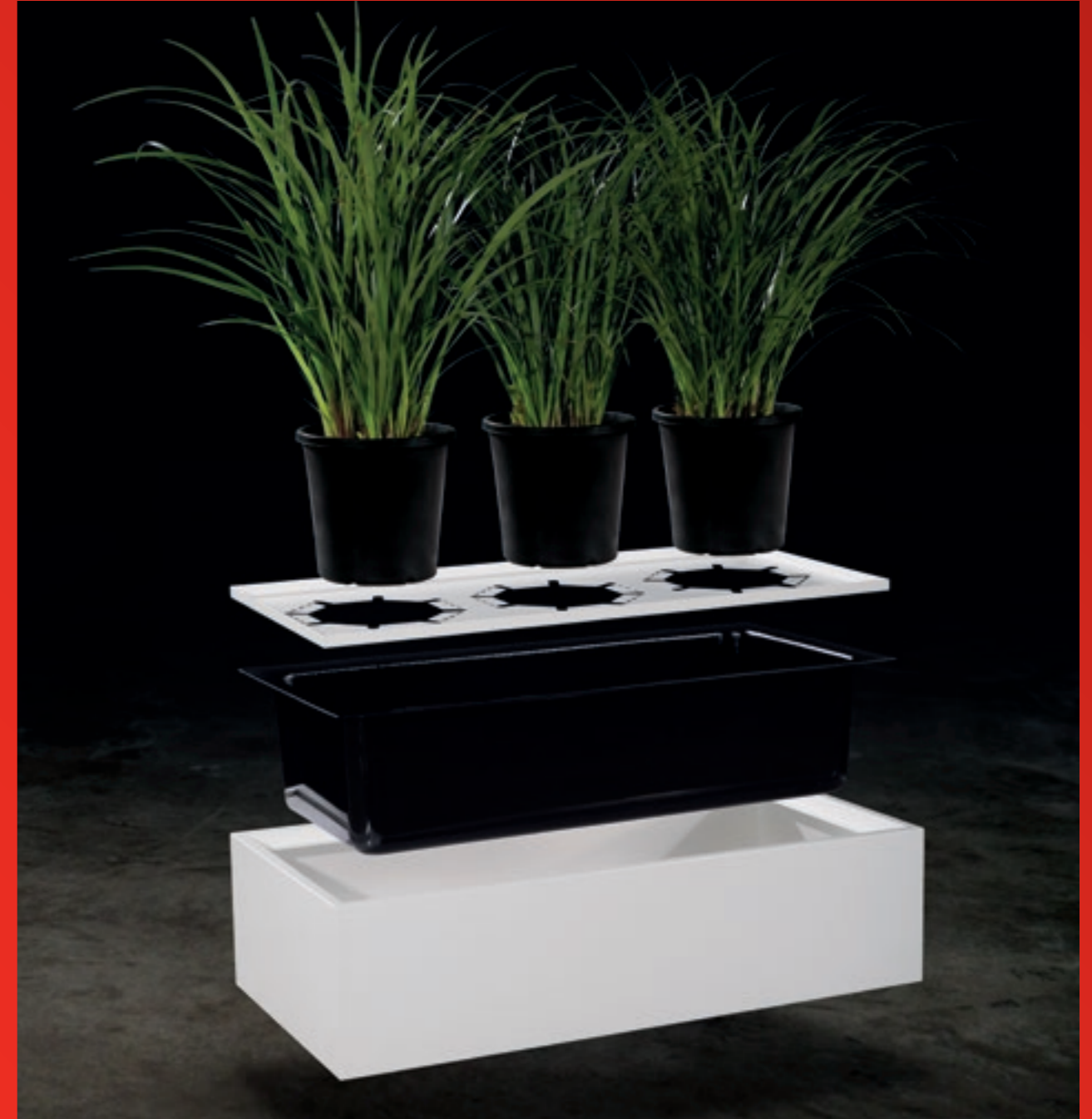
The Strata 2 planters have been designed to work together with the entire suite of Strata 2 cabinets. The modular design accommodates all plant types, and ensures easy maintenance and care.