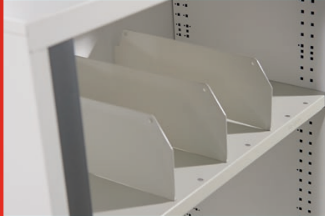
Slotted shelf dividers.