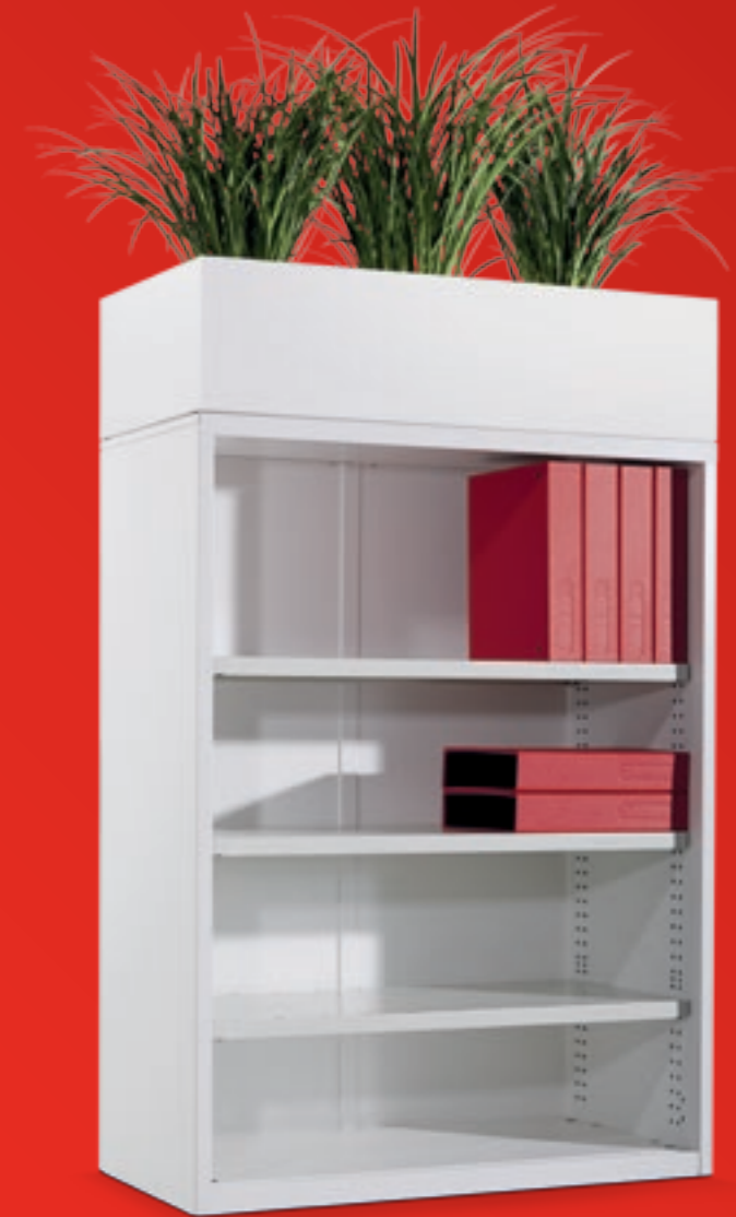
No door (Bookcase)

Please refer to our website, for cabinet specification sheets.