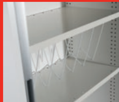
Suspended wire rack.