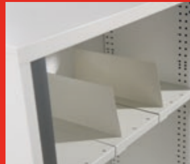
Shelf dividers clip-on.