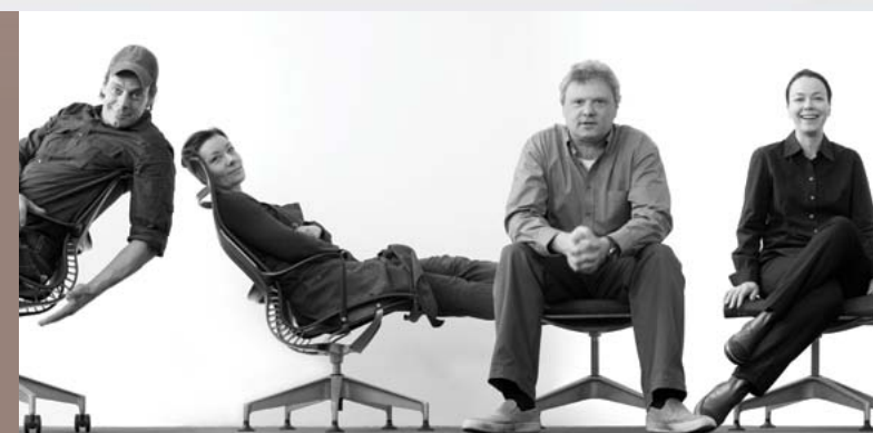
Designers Studio 7.5