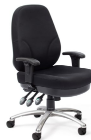
Plymouth Heavy Duty Optional Arms