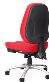
Plymouth Heavy Duty Reverse View